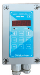
TempMan incl. temperature sensor