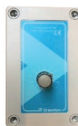
TPR position transmitter